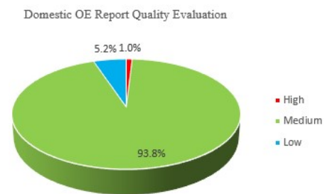
Fig 1. Quality Evaluation Distribution of Domestic OE Reports

was divided into three categories—high, medium, and low—based on report Quality scores. The high range is 15~16 scores, the medium range is 12~14 scores, and the low range is 10~11 scores. Most OE Reports fell in the medium category, with a share rate of 93.8%.