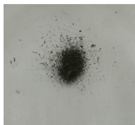
Fig. 1. Solid precipitates formed from radioactive liquid waste via the biological method.

The core mechanism of the developed technology lies in the transformation of dominant radionuclide ions into stable inorganic crystalline phases (Fig. 1) through either chemical or biological pathways.