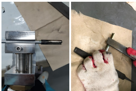
Fig2: Remote Tong Rod Head

After marking the head portion of the rod with a black pen, it is reassembled to identify the part that causes interference. The interfering part is grinded with a file and the operating status of the remote tong is checked.