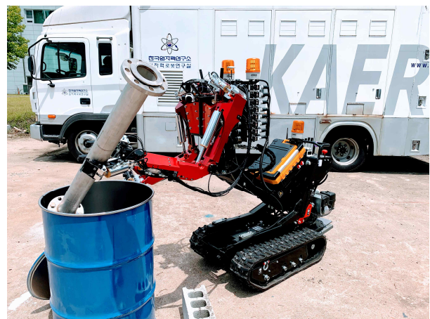
Fig. 1 ARMstrong: a heavy-duty dual-arm robotic manipulator

The linkage structure of ARMstrong was designed by simulating the human body. For mobility, a caterpillar was adopted. A small, mobile hydraulic power pack was installed for the operation of ARMstrong. Fig. 1 shows the concept design of ARMstrong.