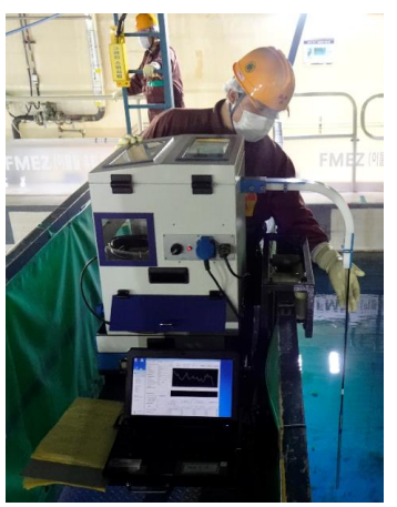
Fig. 3. A field test in Wolsung Nuclear Power Plant to evaluate performance of the selected three scintillators

Fig. 4 is experimental results (electric current) measured by the three scintillation detectors. From Fig. 4, sensitivity of the BC-400 and p-Terphenyl crystals appeared to be dozens of times larger than the present Li glass scintillator(GS30). In particular, signal amplitude of the p-Terphenyl crystal increased dramatically by almost one hundred times in comparison of the GS30 crystal. Two peaks in the