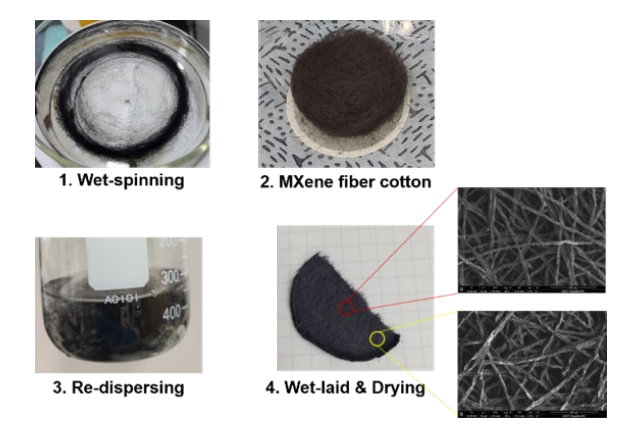
Fig1. Fabrication of MXene fiber fabrics and its microstructure

by injecting MXene solution doped on a syringe in a rotating coagulation bath containing salt-free coagulation agent. After filtering and drying, the staple fibers were re-dispersed in water/ethanol mixture to make semi-soluble state and collected on a metal screen mesh. During the drying process, the semi-soluble staple fibers were interfused and formed a fabric structure.