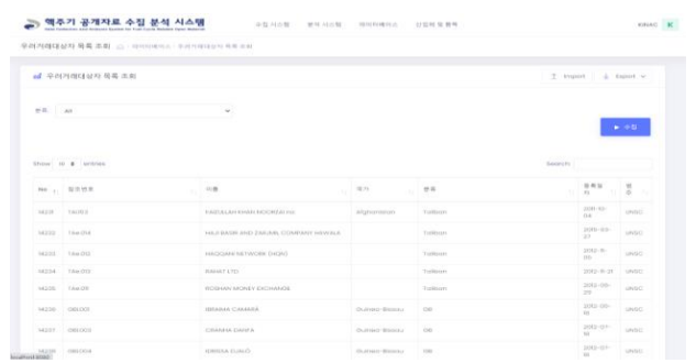
Fig. 2. Screen of the DL collection system

DB displays the information of DL according to user request.