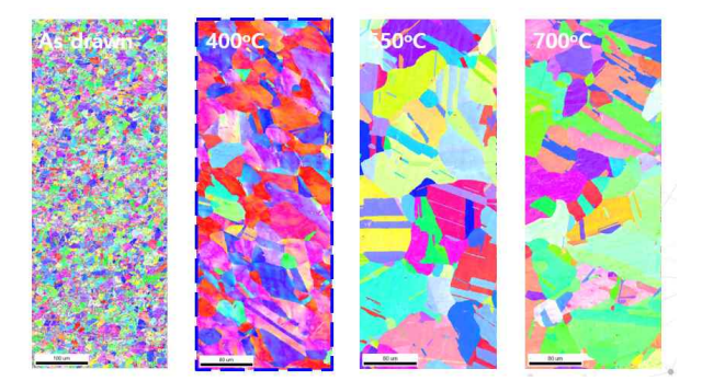
Fig. 1. Texture analysis of heat treated billet (L direction)

In order to confirm the effect of the initial microstructure of the billet on the extrusion result, the microstructure change according to the heat treatment temperature of the billet was observed. Figure 1 shows the results of the EBSD analysis of the billet microstructure at different temperatures. The billet structure before heat treatment showed a typical process ability, and the grain size gradually increased as the heat treatment temperature was increased to 400°C, 550°C, and 700°C for an hour. In the previous study, it was confirmed that the change of grain size had a great influence on the grain distribution after extrusion. In this study, the initial microstructure of the billet was extruded by performing a hot extrusion test on the billet subjected to such heat treatment conditions.