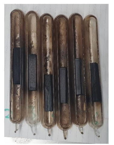
Fig. 3. The wood sample by incomplete combustion

After electrolysis experiment, contaminated wood sample is shipped to sample boat of high temperature furnace. The inner temperature of device was set to 120°C. And air and oxygen gas flows from quartz tube including sample boat shipped wood sample. By flow of gases, tritiated water molecules inside of wood sample becomes tritiated water vapor and separated from wood sample. Separated tritiated water vapor are captured to 0.1 M nitric acid solution connected to end of quartz tube. After drying for 11 hours, wood sample is combusted on temperature of 500 °C. It is process to extract residual tritiated water from wood sample by combustion. In this process, wood sample should be decomposed to fine piece physically for protection of incomplete combustion as Fig. 3. Nitric acid solution is mixed with liquid scintillator (Gold star) for making liquid scintillation counter (LSC) cocktail. Mixing volume ratio between nitric acid solution and liquid scintillator was 8:12.