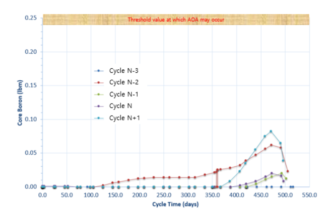
Fig. 2. Core boron mass with measured flow rate