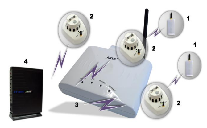
Fig. 2. Flow sensor nodes

can be connected directly to the server because AGM-200 shall apply to the optional. Sensors are shown in Figure 2.