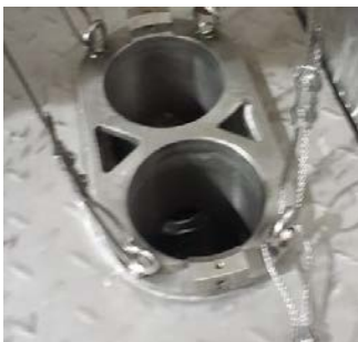
Fig. 5. Installation test on the pool platform

The length of the wire rope of the fuel basket is adjusted during the installation test. Pool and pool structure dimension and operation height of the hoist of the operation bridge are considered to confirm the length of the wire rope.