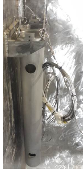
Fig. 4. Installation test on the basket hanger