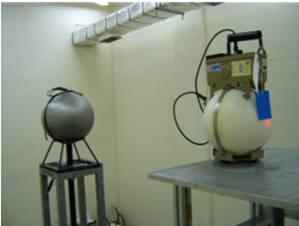
Figure 1. Calibration view of neutron instrument by D 2 O moderated ^{252}\text{Cf} source

Distance positioning system, source storage and pneumatically transporting system, video camera, D 2 O moderating sphere and laser pointing the source position are installed for the calibration. Figure 1 shows a calibration view of neutron instrument. Two kinds of neutron field, bare ^{252}\text{Cf} and D 2 O moderated ^{252}\text{Cf} neutron field, are being used for the calibration.